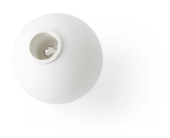
TR Bulb 1470639